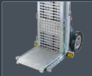
Support for load fork

Thanks to these stairs you can comfortably load and unload your transporter, trailer, or transportation vehicle. Boot sills between 480mm – 900mm in height are possible. If your vehicle has a tow-bar you need the auxiliary stairs with an extended support.