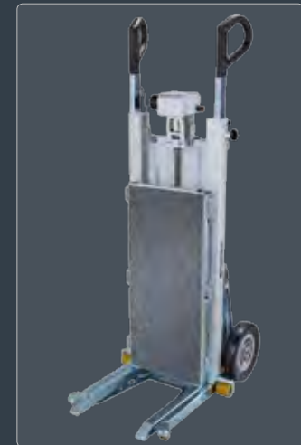
Back wall with felt cover