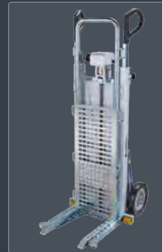
Support bow for high goods