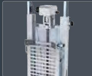
Support for round containers