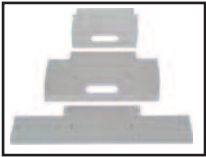
Diverse assortment of toe plates