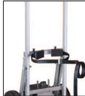
Strap for round containers 150 to 800mm dia