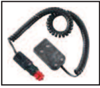
Vehicle charging cable in 12V and 24V