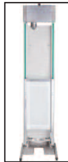
Vertical lift - electric