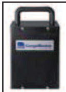
Additional battery for continuous operation