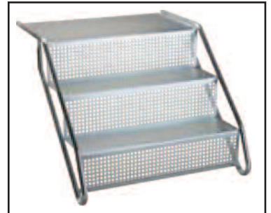
Steel stairs - 350 kg in 3, 4 or 5 step