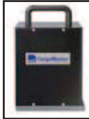
Mega battery pack for long operation