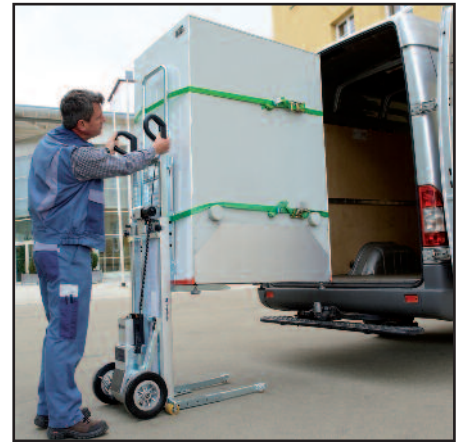
Loading and unloading of vehicles is facilitated tremendously by the integrated lift

Even handling extremely heavy goods with the CargoMaster does not damage the stairs nor the goods