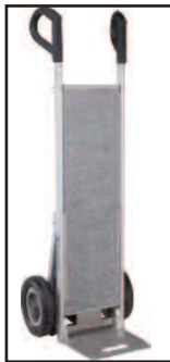
Back plate with felt cover