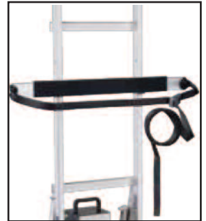
Strap for whitegoods adjusts 510-630mm