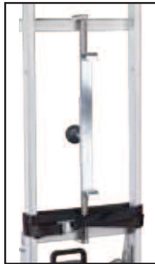
Device to secure grocery boxes