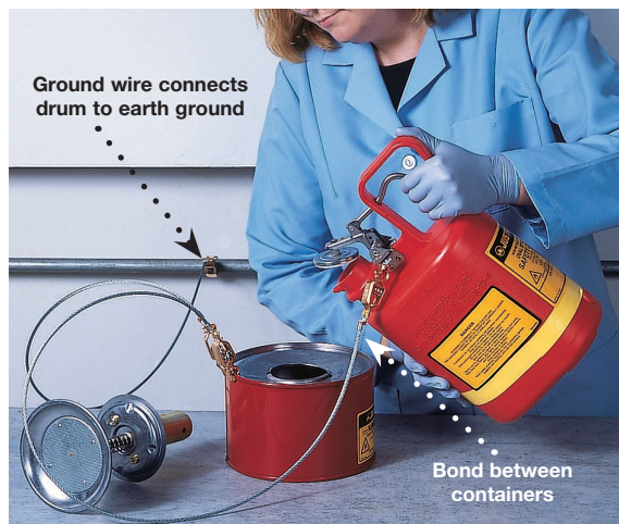
Bond dispensing can to receiving container, then ground receiving container to a water pipe or ground strip.