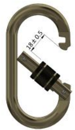
KARABINER DETAIL B