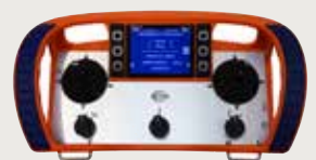
Radio-remote control with display

Solving has developed a new generation Air Film Movers for the handling of transformers, windings or components. The Movers are operated by a radio-remote control fitted with a colour display. This allows easy access to all the necessary information resulting in an even safer and more ergonomic operation.