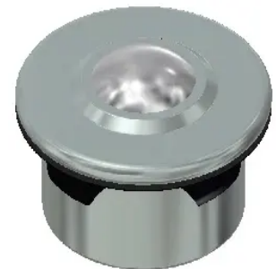
CWC02 Ball Transfer