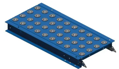
Ball transfer table 750 mm