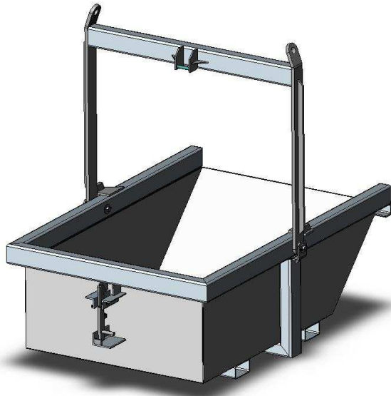
(Standard MBWB30 model shown)

The type MBWB30 Bulk Waste Bin is ideal for building and mining sites using overhead cranes. This Bin is designed to suit your application with a capacity up to 5.0 Tonne Safe Working Load (SWL).