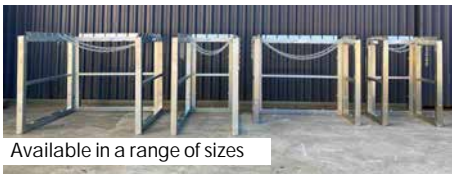
Available in a range of sizes