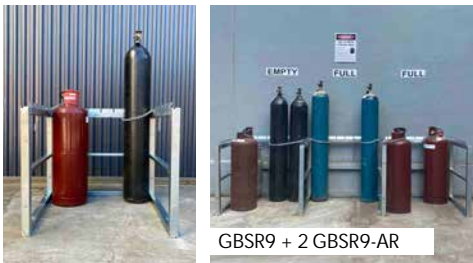
GBSR9 + 2 GBSR9-AR