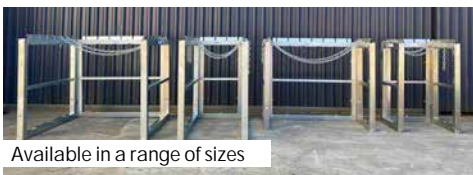
Available in a range of sizes