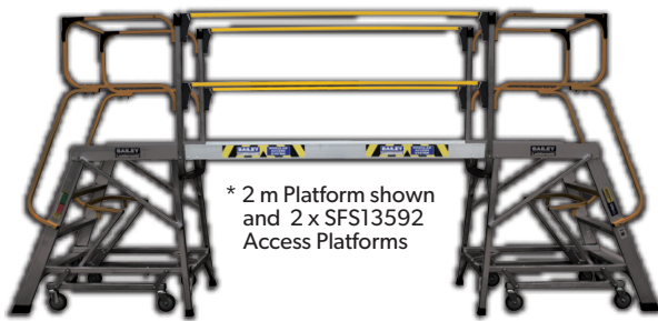
* 2 m Platform shown and 2 x SFS13592 Access Platforms