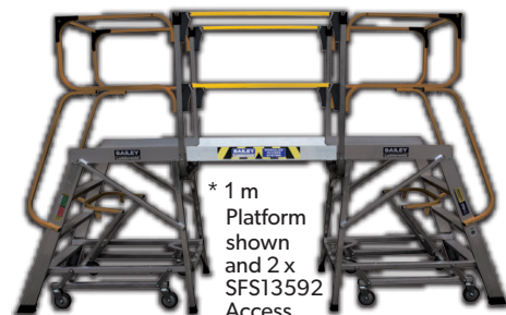
* 1 m Platform shown and 2 x SFS13592 Access Platforms